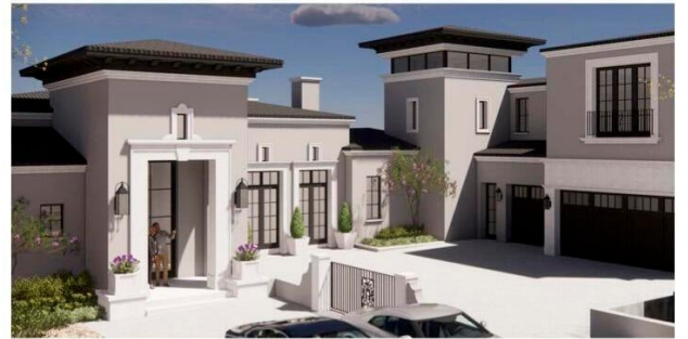
2025 ARMLS FRONT ENTRY, STAIR TOWER AND AUTOCOURT

This exceptional lot comes with professionally designed plans by PHX Architecture, these plans have already passed the rigorous Hillside Review—a process that typically takes over a year—and are now advancing through the city submittal process setting the stage for a streamlined build. Cameron Custom, Camelot Homes Nationally recognized ProBuilder of the Year custom Division, is the builder slated to construct this stunning home, has been deeply involved throughout the pre-construction phase. Their intimate knowledge of the plans ensures a smooth transition into construction and the highest level of craftsmanship. Every detail has been thoughtfully considered, from the meticulous floorplan to the sophisticated interior design completed by Alisha Taylor Interiors. The layout artfully blends modern convenience with traditional charm to create a warm and inviting space. Highlights include: - A spacious great room with a split floorplan and an expansive entertainment yard/patio - Three secondary bedrooms, each featuring its own walk-in closet and ensuite bathroom - A primary suite with dual closets and direct backyard access - A luxurious office with picturesque views